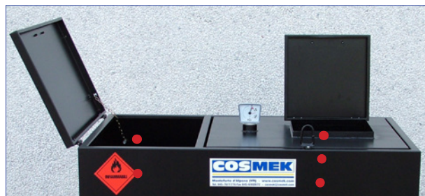
Filters container Oil container