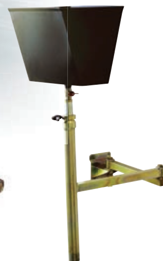
Code 7574 Wall mounted drain assembly 25 litres tank capacity