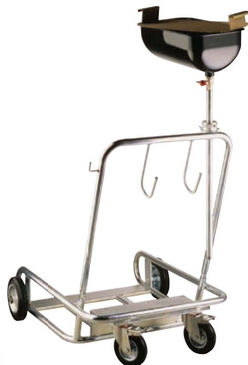
Code 7504 Trolley for 50 Kg. drums with 10 litres basin capacity