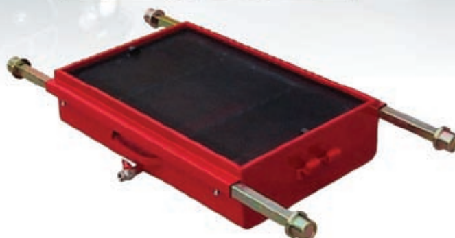
Code 7541 Rolling oil drain for pit recovery 70 litres tank capacity