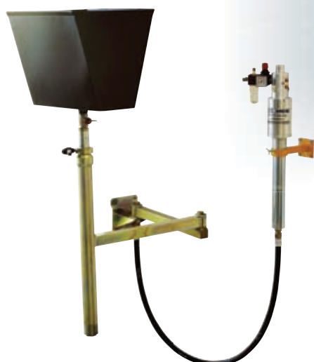
Code 7510 Wall mounted drain kit equipped with 10 litres tank capacity