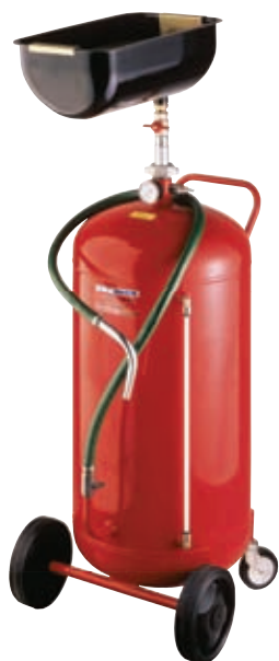
Code 7500 90 litres oil-recovery capacity with 10 litres basin