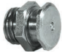
Hexagonal head with double hexagon Teca- lemmit. In accordance with UNI 7662 B

A= conical thread ch= exagon key L= total length L1= thread length