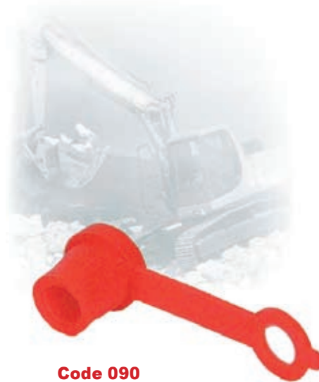
Code 090 Cap for grease nipples

Code 08600 Case with grease nipples and couplers. Dimension: 240 x 180 mm