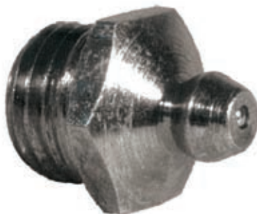
HYDRAULIK grease nipple sphere head In accordance with UNI 7663 A