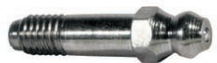
HYDRAULIK grease nipple sphere head. In accordance with UNI 7663 A