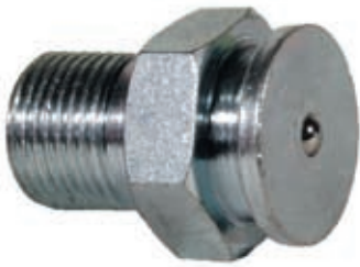
Grease nipple for track circle head