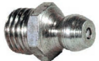
HYDRAULIK grease nipple sphere head In accordance with UNI 7663 A