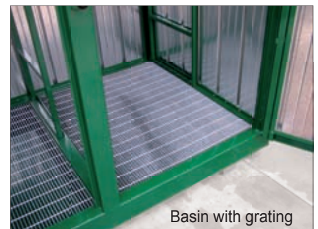
Basin with grating