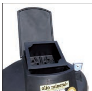
hatchway with filter-draining container